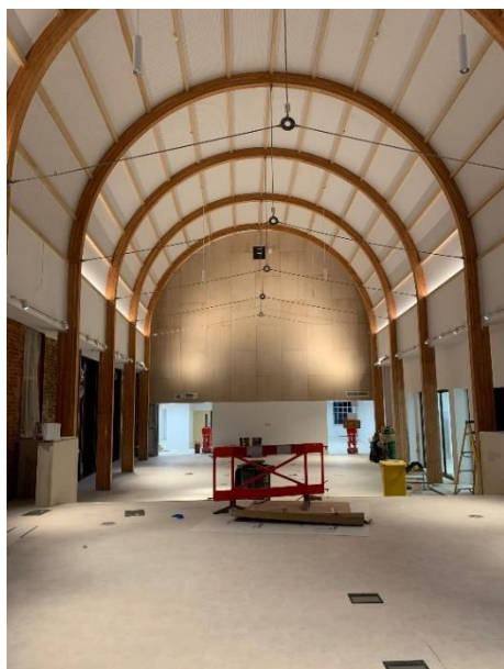
3. Library space