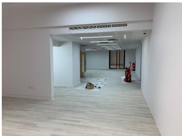
1. Archive reading room