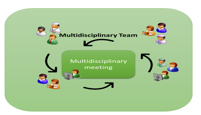
Fig 1. Multi-Disciplinary Team Meeting (MDMs)

The vision is for all services to be part of these Local Care Multi-Disciplinary Teams.