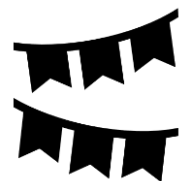
Chart Sutton Parish Council held a Big Jubilee Lunch on 5th June 2022, in celebration of the Queen's Platinum Jubilee. Designed to bring the community together to celebrate a momentous event and also an opportunity to come together once again following the COVID-19 pandemic. Member Grant funding provided portable toilet hire, marquee hire, food and table and chairs.