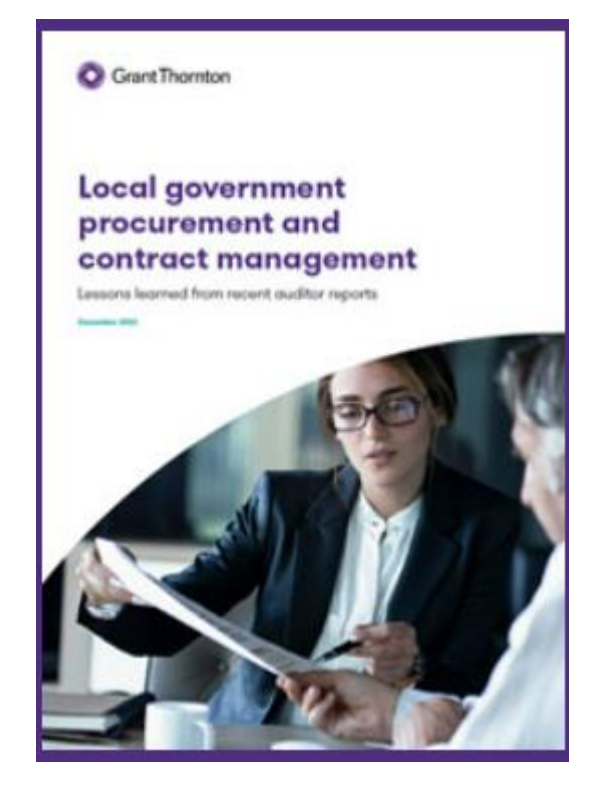
Read the full report here: <u>Local government procurement and contract management:</u> Lessons learned | Grant Thornton