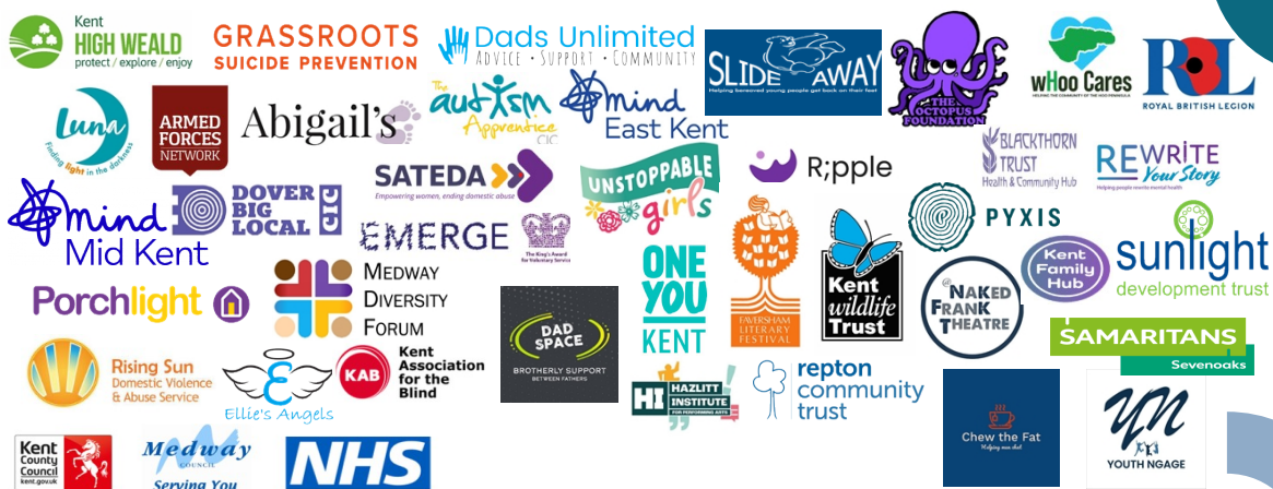
Illustration – Kent and Medway Suicide Prevention Network Members

Alongside our Networks, the Suicide Prevention Strategic Oversight Board consists of senior Public Health colleagues from Kent County Council and Medway Council, Kent and Medway Mental Health NHS Trust and NHS Kent and Medway. The Strategic Oversight Board takes financial decisions and provides the formal pathway into KCC, Medway Council and NHS Kent and Medway governance structures.