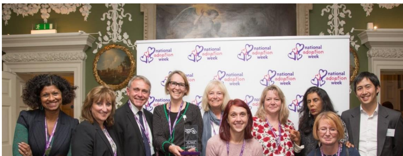
Robert Goodwill (Children's Minister, October 2017) meets members of the Post Adoption Support Team, Coram and adoptive parents