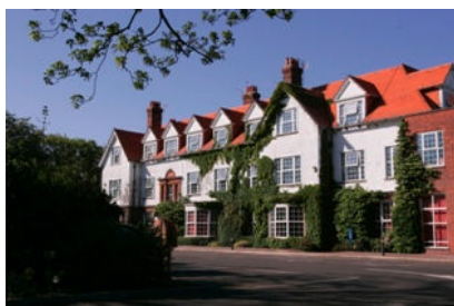
The Secondary Department Margate